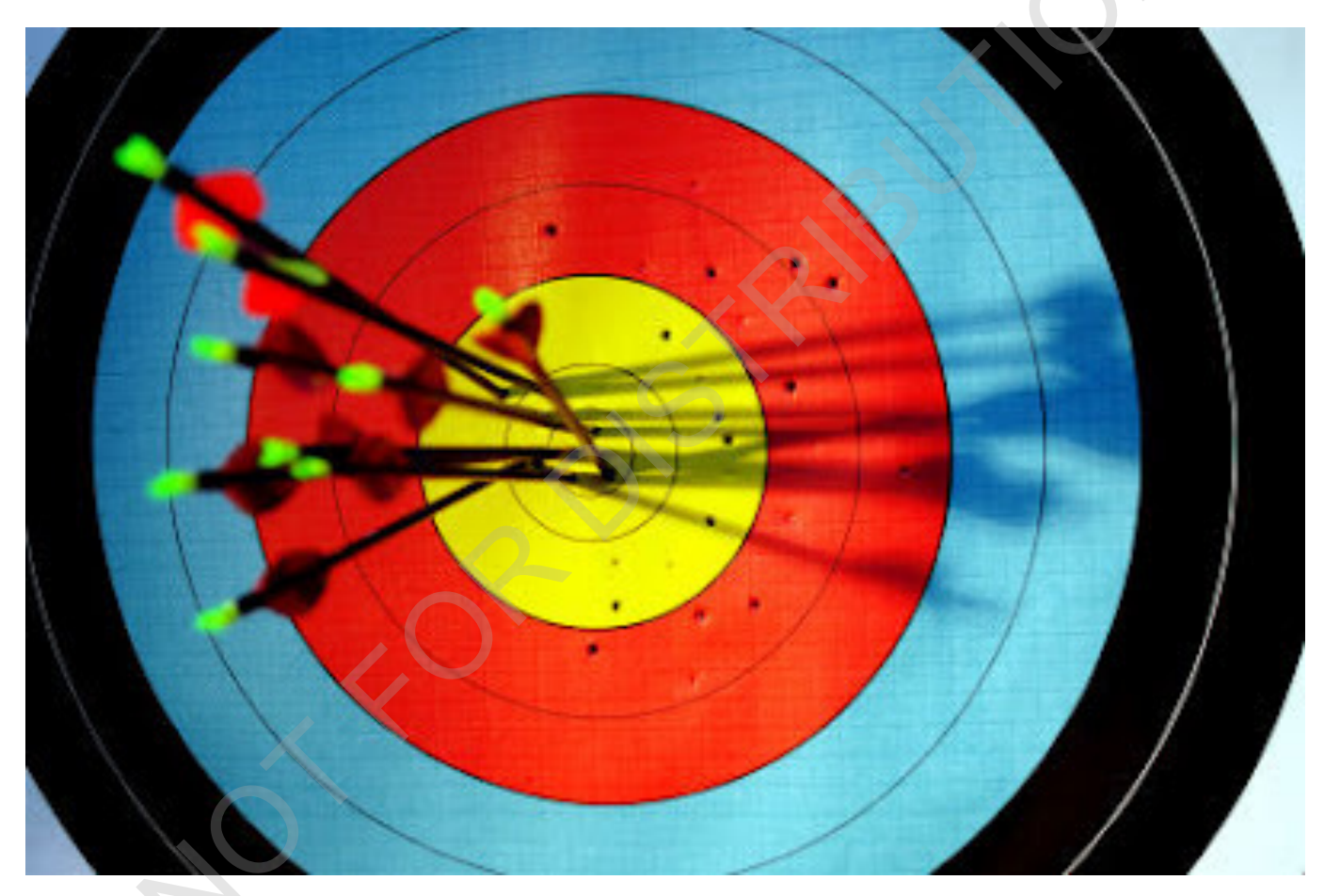
AN EQUITABLE RESULT FROM AN EQUITABLE PROCESS