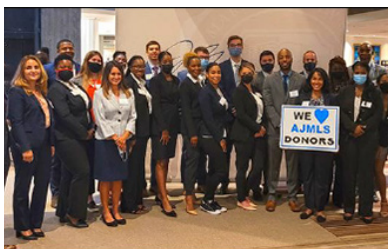
Alumni and Donor Full-Time Program