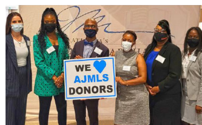
Alumni and Donor Part-time Program

* denotes donor is deceased ** sharing some of the many recipients who have benefited from your generosity