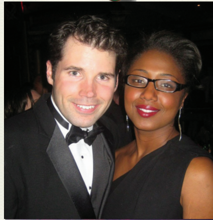
2011 Barristers Ball April 2nd - See you there!